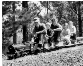
Southern Highlands Model Eng inc